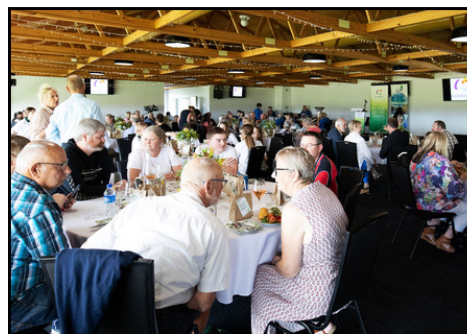
The Allan Scott Glenburnie Racecourse function building during the lunch service.