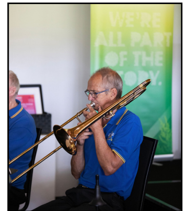
Member of the Mount Gambier City Band playing.