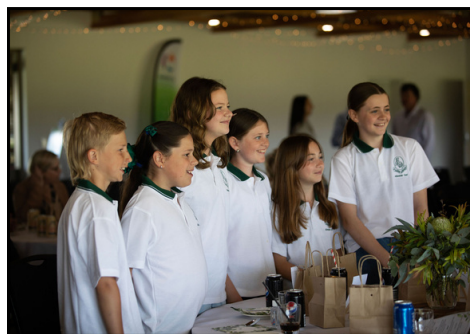
Allendale East Area School students - Active Citizenship Award winners