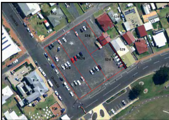
Pictured above: (Aerial view of Old Port MacDonnell Boat Yard site.