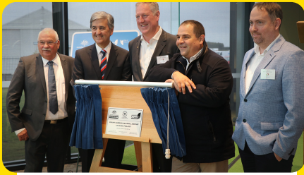
Opening of the new Mt Gambier Regional Airport