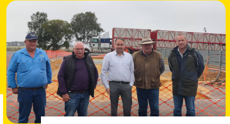
Inspecting the works on the new effluent pit at the Sale Yards