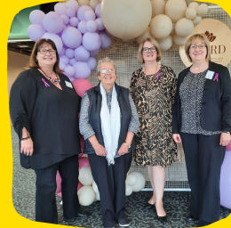
WiBRD International Women's Day breakfast