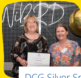
DCG Silver Sponsors of WiBRD