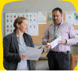
Drawing the winner of the staff survey