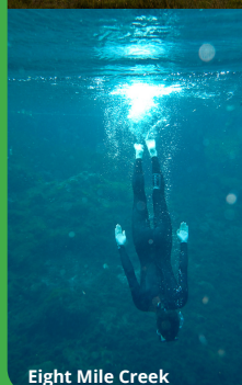
Eight Mile Creek